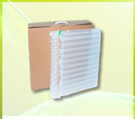
15" LAPTOP HANDLE PACK Deflated dimensions 48 x 48cm