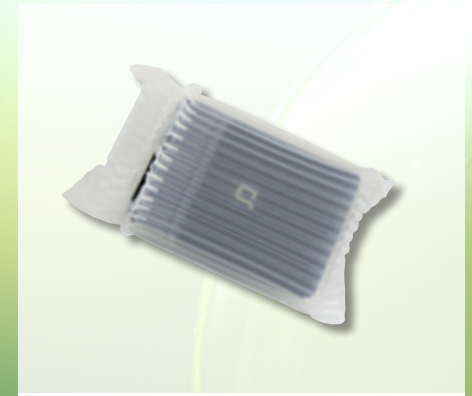
10" LAPTOP BAG Deflated dimensions 36cm x 33.5cm

Q Type bag, 3cm chambers, green nozzle. All laptop bags can be supplied with a bespoke outer box, which includes a separate partition for power cable and plug. Outer mailing bag also available.