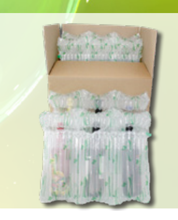
TWELVE BIOPACK 4 x Bio Treble bottle bags