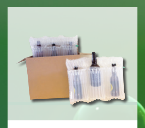
BEER SIX AND TWELVE PACKS** Deflated dimensions 65cm x 35cm