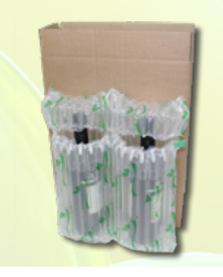
DOUBLE BIOPACK Deflated dimensions 48cm x 41.5cm