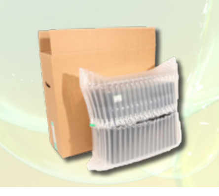
PC END CAPS PACK Sizes for; Towers and SFF