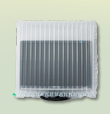
19" MONITOR PACK