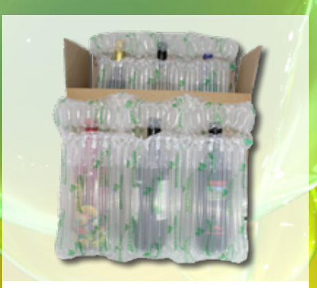
SIX BIOPACK 2 x Bio Treble bag