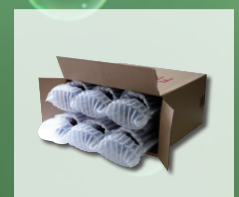
SIX BOTTLE PACK** 2 x Treble bottle bags