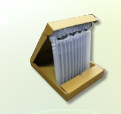
13" LAPTOP PACK Deflated dimensions 32.5cm x 39cm