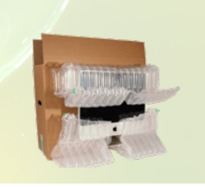
IMAC PACK Sizes for; 19", 21" and 27"