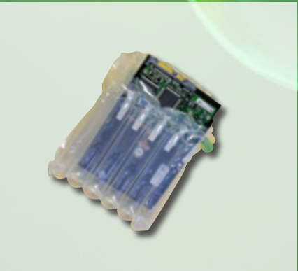
HARD DRIVE BAG Q type bag, 2cm chambers, green nozzle Deflated dimensions 18cm x 21.4cm