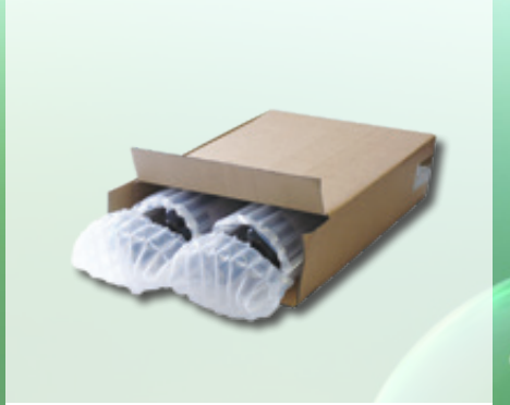
DOUBLE BOTTLE PACK* Deflated dimensions 48cm x 41.5cm