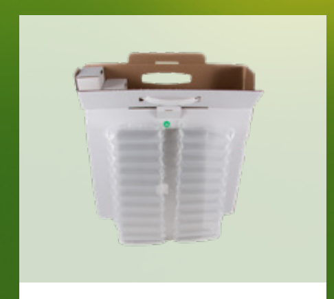
MACBOOK PACK (Bag & Box) Deflated dimensions 18.5cm x 38cm