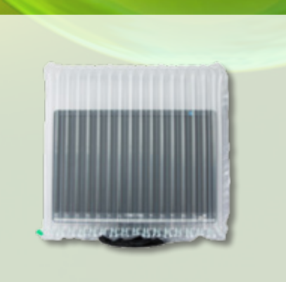
24" MONITOR PACK