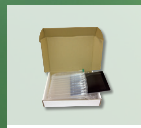
iPAD/TABLET PACK Q type bag, 2cm chambers, green nozzle Deflated dimensions 21cm x 30.4cm