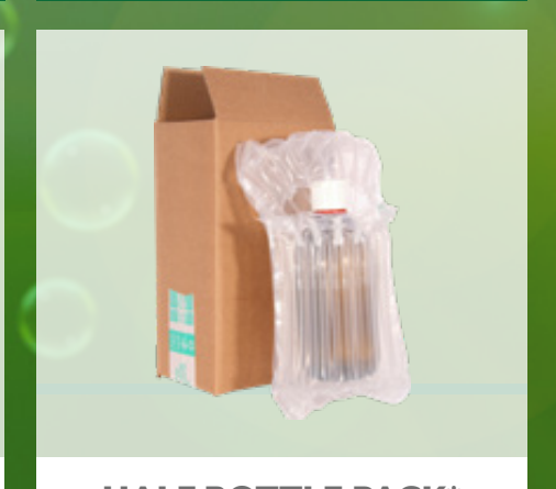
HALF BOTTLE PACK* Deflated dimensions 24cm x 30.5cm