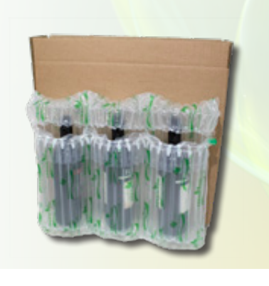
TREBLE BIOPACK Deflated dimensions 72cm x 41.5cm