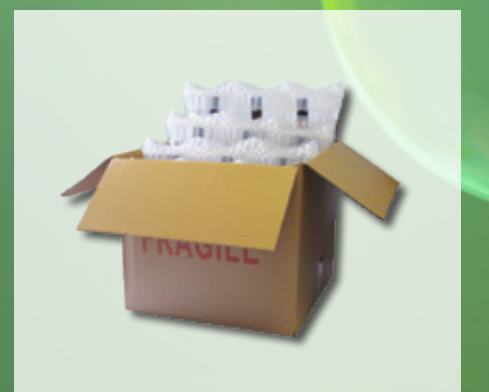
TWELVE BOTTLE PACK** 4 x Treble bottle bags