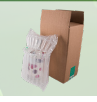
75CL BOTTLE PACK* Deflated dimensions 30cm x 31cm