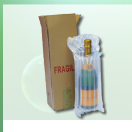
SINGLE BOTTLE PACK* Deflated dimensions 21cm x 41.5cm